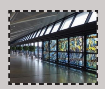
哥本哈根機場滿佈彩色玻璃飾畫 Colour glass decoration at Copenhagan Airport

懸掛在青衣公共圖書館內的裝置 Installation hanging from the ceiling of Tsing Yi Public Library