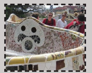
以馬賽克鑲飾的座椅 設計為西班牙桂爾 公園的訪客增添樂趣 Mosaic bench facilities delights the visitors of Park Guell in Barcelona