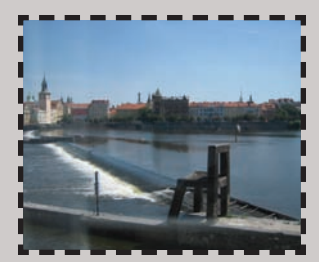
巨型椅子佇立在布拉格河道上 A giant chair standing at the river bank in Prague